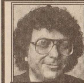
Mark A. Bruzonsky