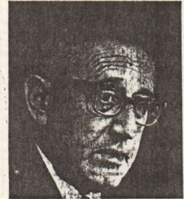
Is this the man to represent U.S. in Mideast?

There are legitimate differences in perspective, of course, as to whether the intifadeh, the PLO peace offensive, or both in coordination, can achieve this goal. For many, the possibilities have always been remote that primary reliance on political and diplomatic efforts on the world stage could in the end be successful. Others are waiting in the wings for their own chance to step in, if the efforts currently underway become discredited