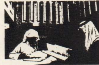
The 20th Century: Modernization