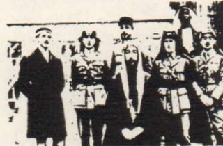
The 20th Century: Imperialism, Nationalism, and Independence