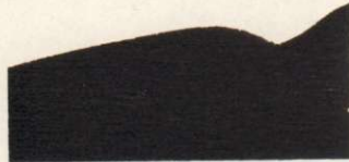
Lands of the Middle East