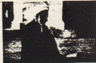
Religion and Culture