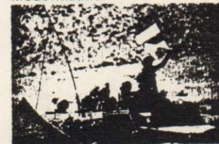
The 20th Century: The Recent Years – Conflict and the Search for Solutions