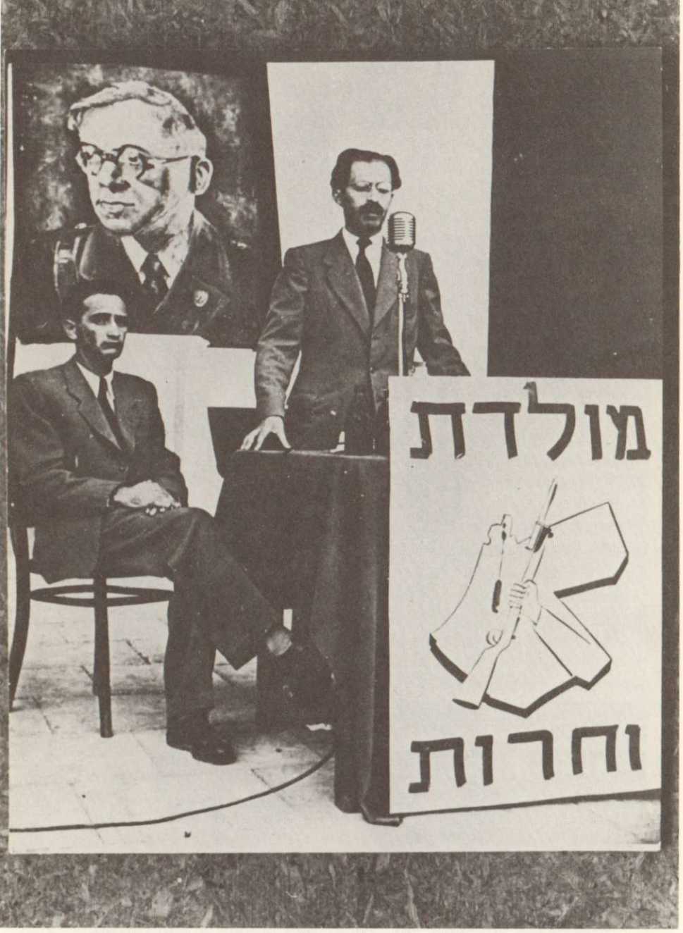
Menachem Begin, in the early 1940s, speaking before his Herut Party gathering. In the background is a photo of Ze'ev Vladimir Jabotinsky and in the foreground is the emblem of Begin's party showing what they consider to be all of Palestine. The Hebrew reads, "For Homeland and Freedom," Freedom (Herut) being the name of Begin's party.

It is necessary, however, to recognize that the line between advocacy and imposition is unclear and subject to interpretation. Clearly the U.S. has various levers of influence – military and economic aid, political support, strategic agreements – which will have to come into play as part of any serious and determined strategy for achieving the peace that has eluded previous American administrations. Crucial to the success of an attempt to nurture peace will be American determination and American persistence. Too often in the past, policy has been uncoordinated within the many departments of the American government and subject to bitter personal confrontations for power and influence.<sup>7</sup> Too often in the past, policy has been insufficiently thought through and thus subject to displays of conceptual insecurity by policymakers who themselves have been insufficiently informed about the historical and political thickets into-which they wandered.