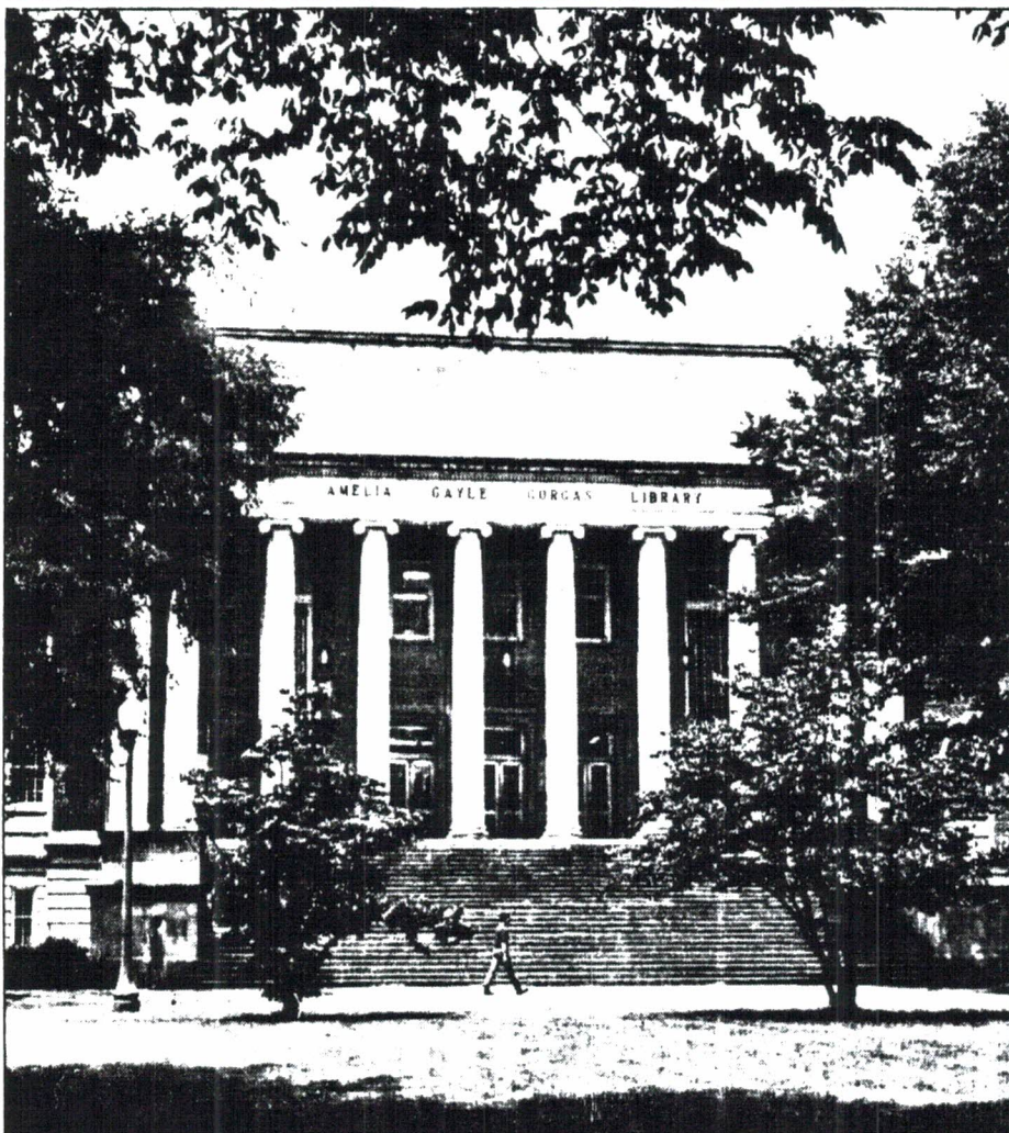
Another unfounded fear: Arab grants to American universities