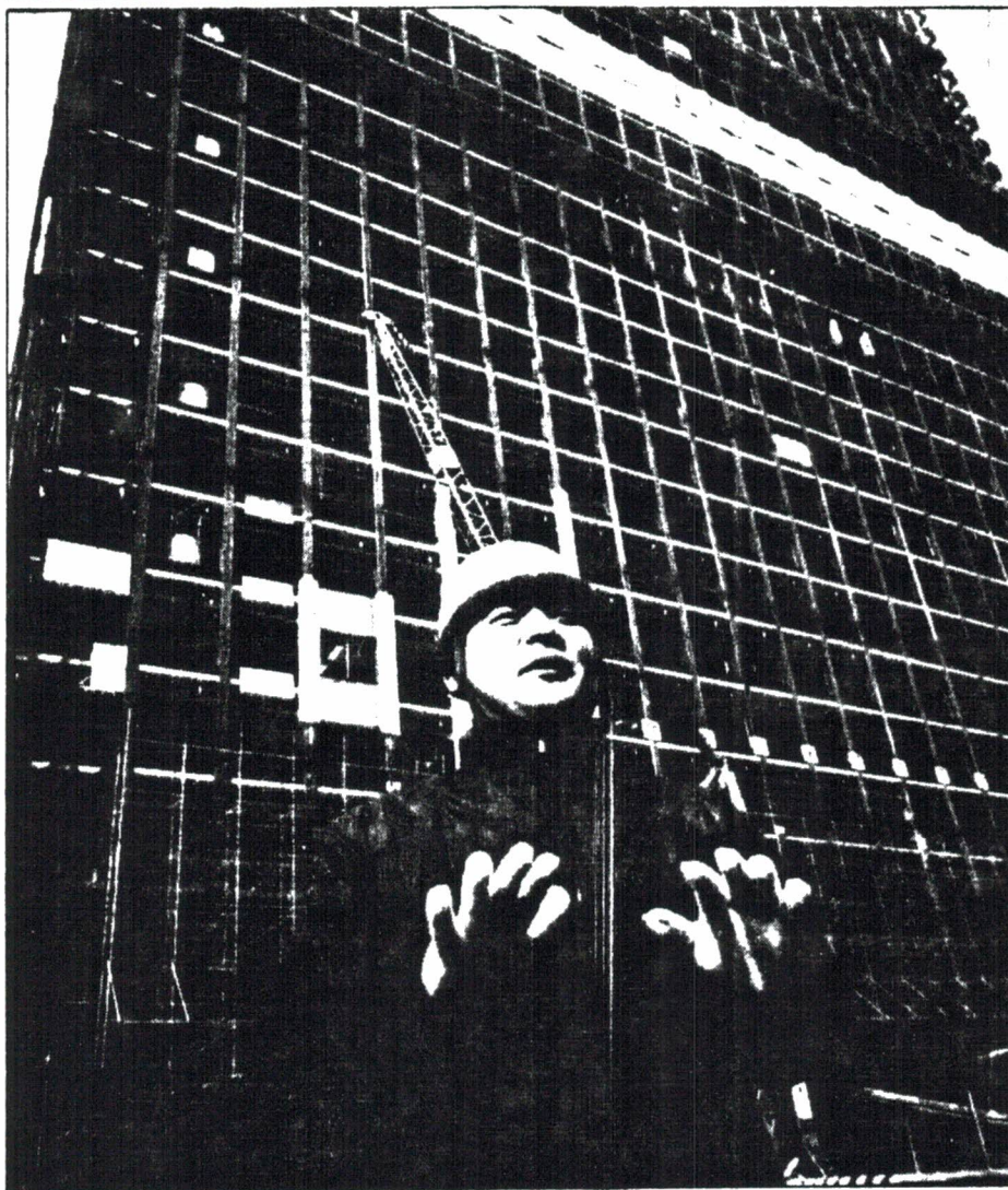
Japanese construction boss in Tokyo; the threat is in "direct proportion to how foreign foreigners are"

Commerce Department official Milton Berger admits. Even so, according to the Real Estate Washington article, "to suggest that foreign investment is a major force in the hyper-active Washington real estate market would be inaccurate."