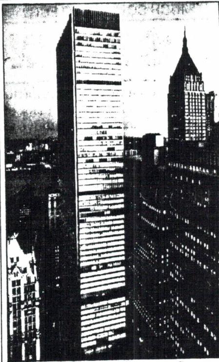
Chase Manhattan, New York; Senate concern on "bundles of foreign money"

... The cover of the first issue of Real Estate Washington - "a slick, classy bimonthly" says The Washington Post - pictures a smiling Arab with the caption "Is Washington for Sale?" and dollar signs in