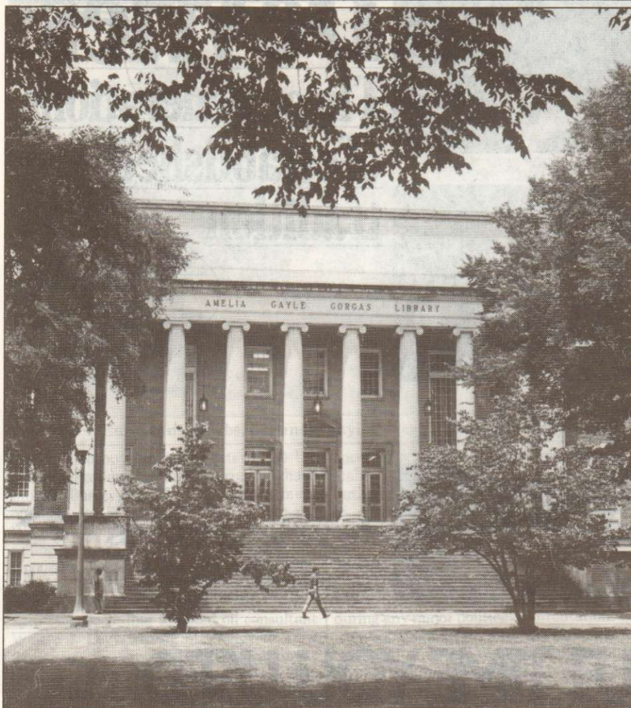
Another unfounded fear: Arab grants to American universities

how we're losing our power in the world."