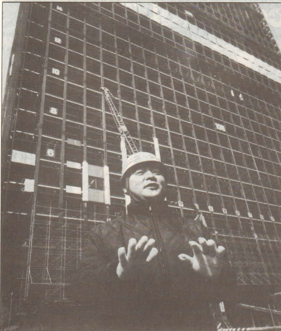
Japanese construction boss in Tokyo; the threat is in "direct proportion to how foreign foreigners are"

Commerce Department official Milton Berger admits. Even so, according to the Real Estate Washington article, "to suggest that foreign investment is a major force in the hyper-active Washington real estate market would be inaccurate."