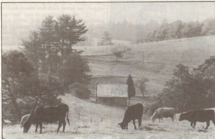
New myth: Europeans, Arabs, Japanese buying every square inch of top soil

attempts to buy large segments of the US stock market and American farm land have proved illusory. One Treasury Department official recently confided in private that the West had learnt to do a fantastic job in selling the Arabs everything imaginable, recouping through recycling much more of the petrodollar bonanza than had been expected just a few years ago.