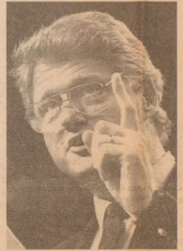
President Bill Clinton