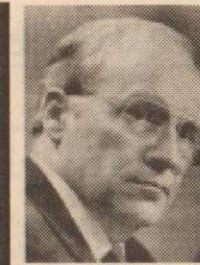
Defence Secretary Richard Cheney