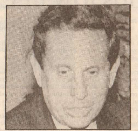
Solarz, during his visit to Pakistan In January

Having already cornered Pakistan into substantially retrenching on its long-standing programme to develop nuclear weapons—at least a nuclear weapons capability to partially offset India's possession of these weapons—the next step seems to be to threaten any forces in